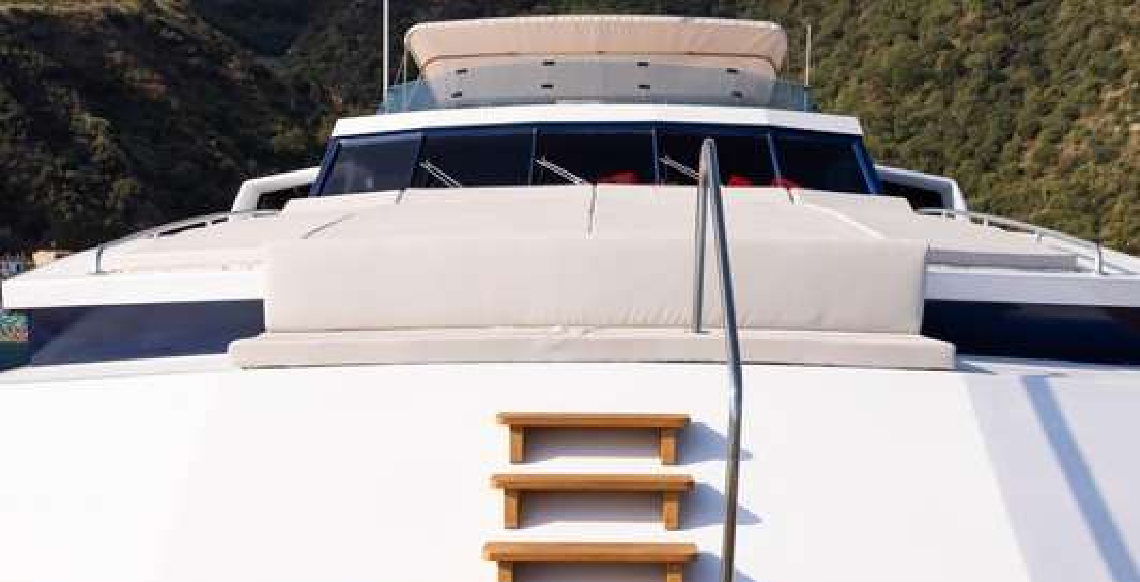
BOW | SUNBATHING AREA