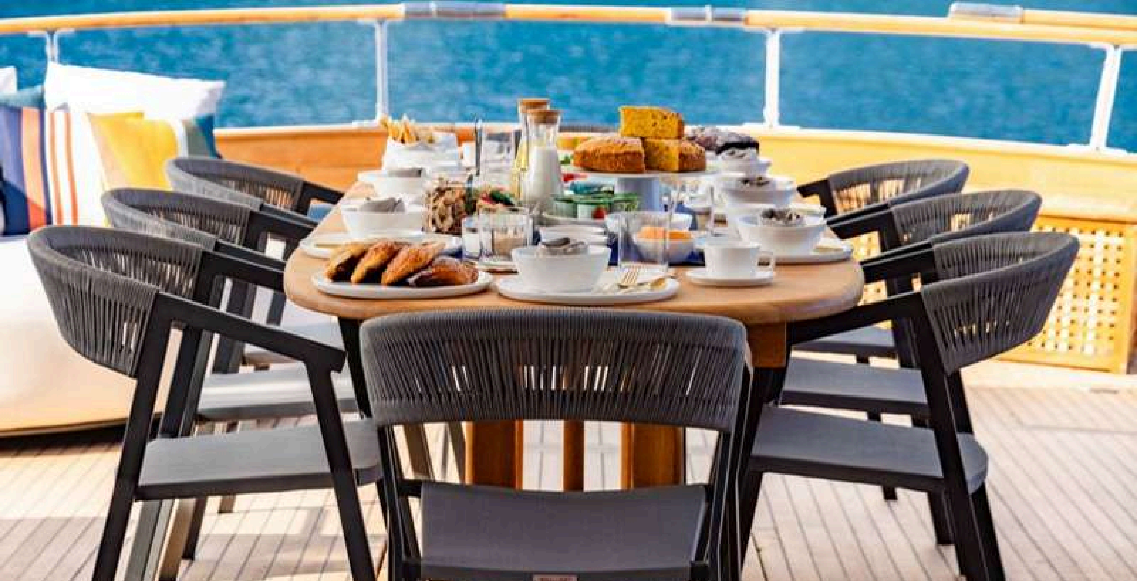
MAIN DECK | DINING AREA