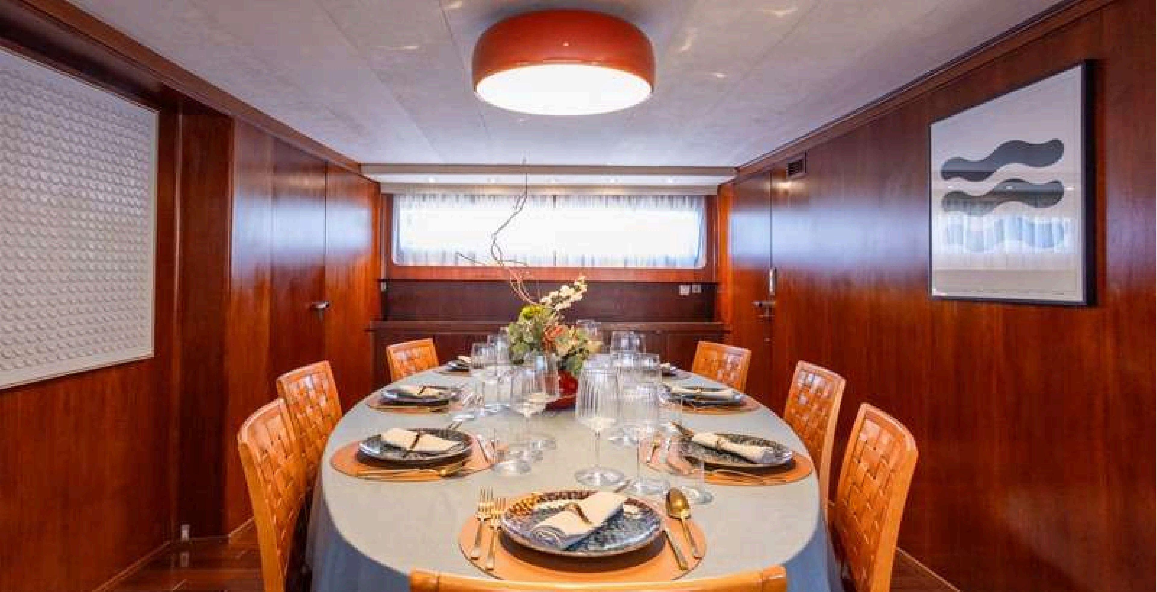
INDOOR DINING ROOM