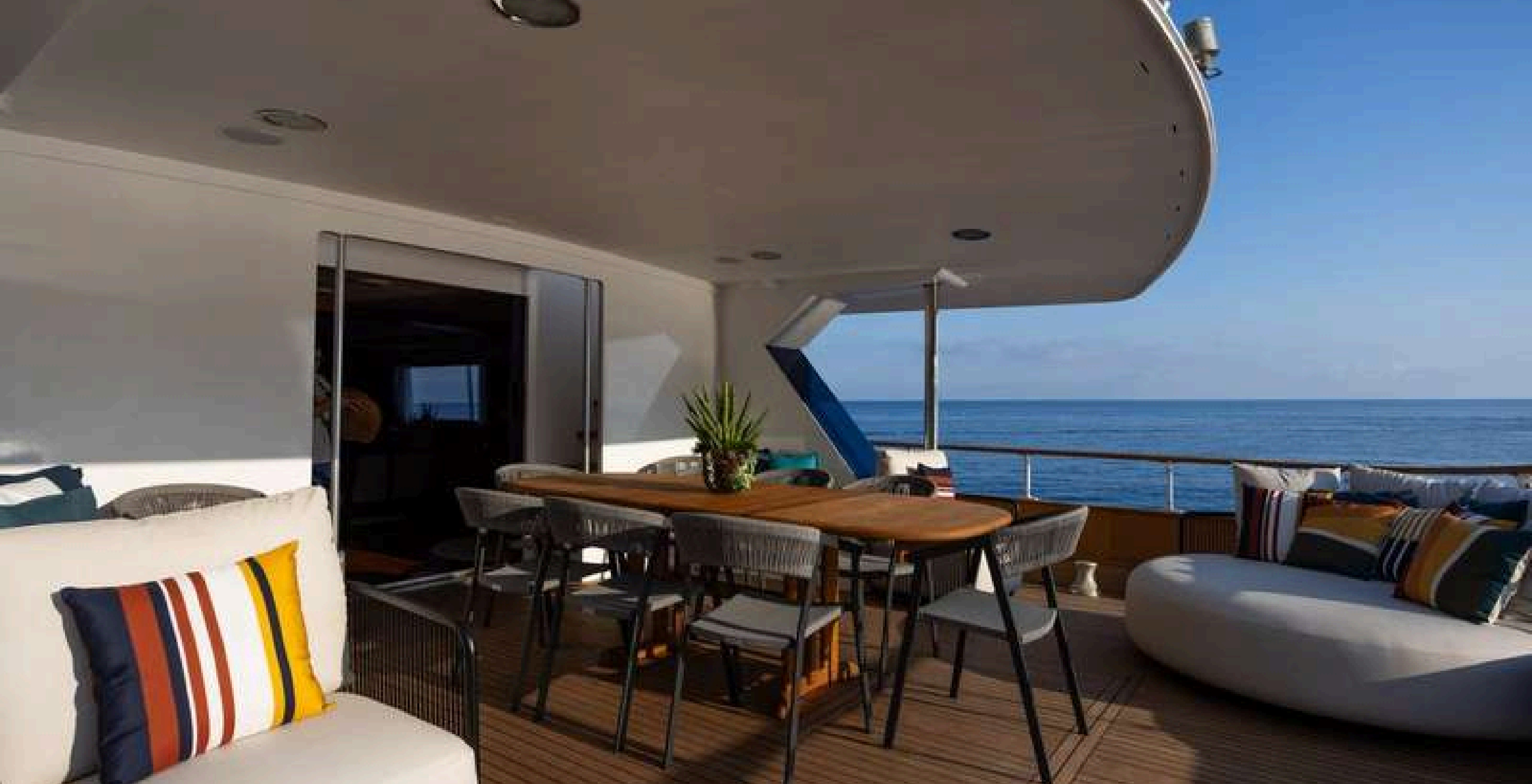
AFT MAIN DECK