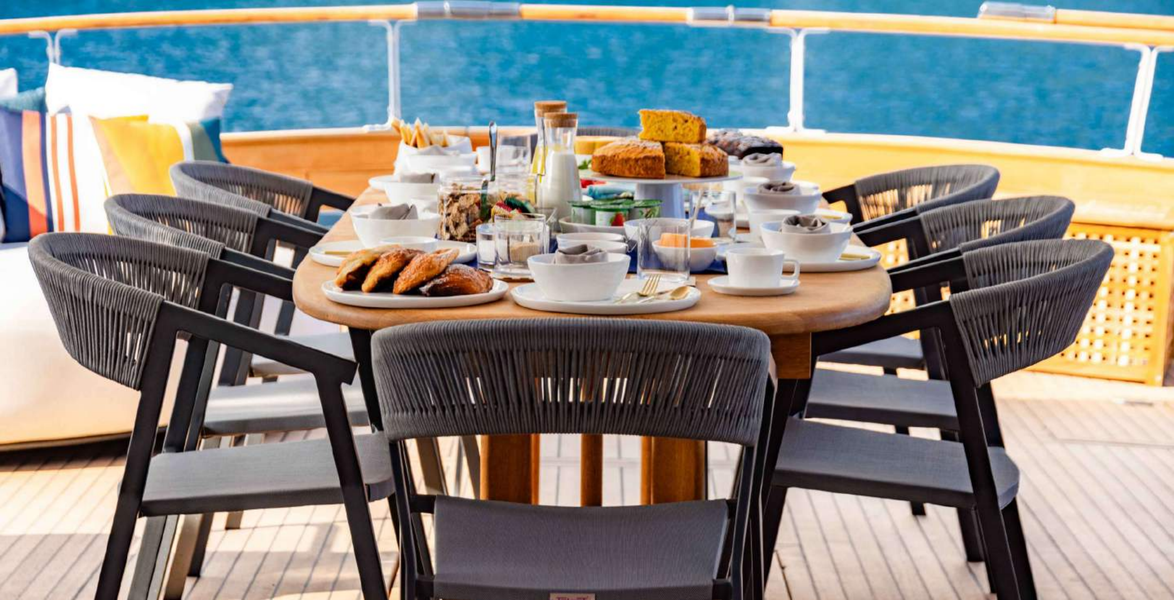
MAIN DECK | DINING AREA