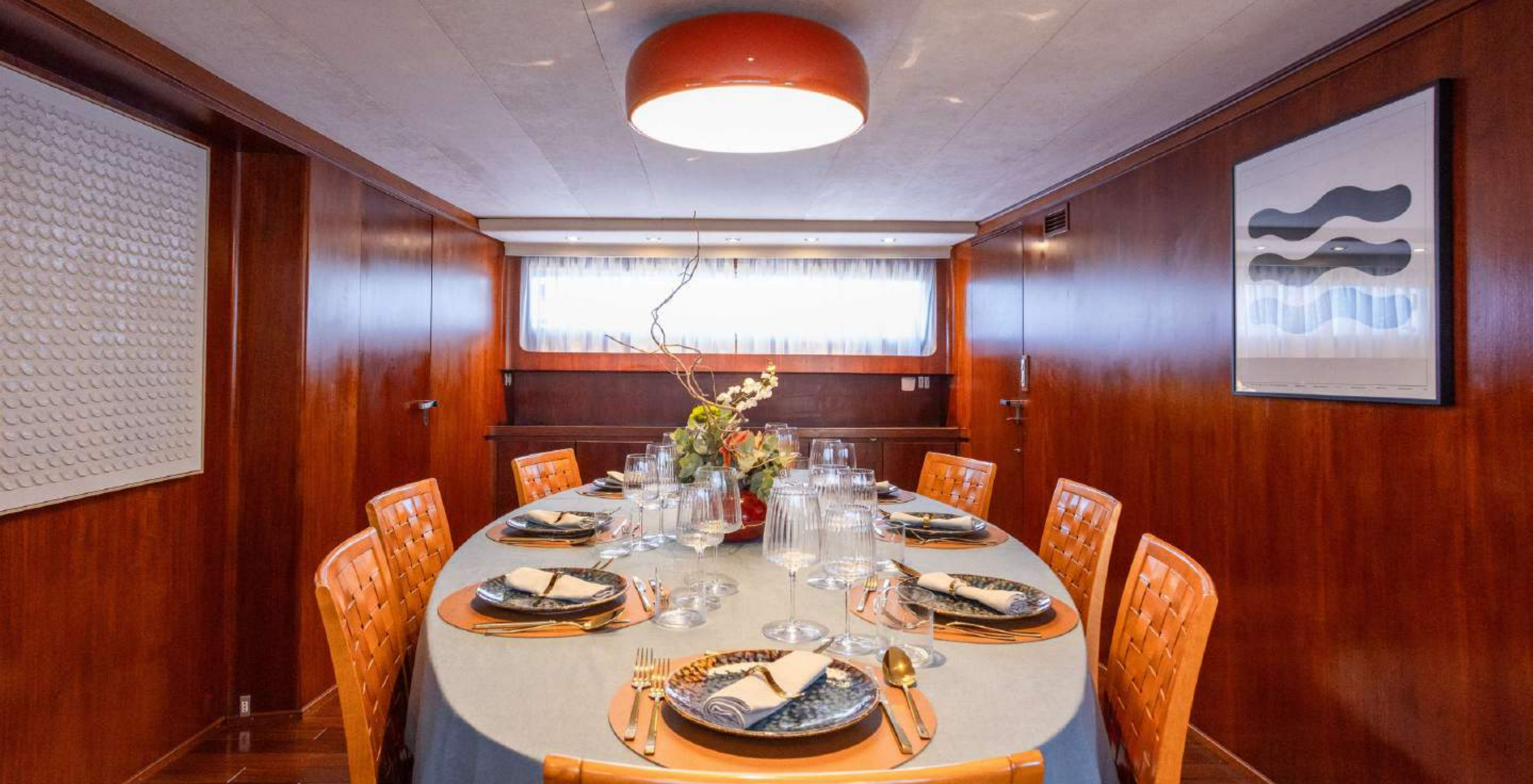
INDOOR DINING ROOM