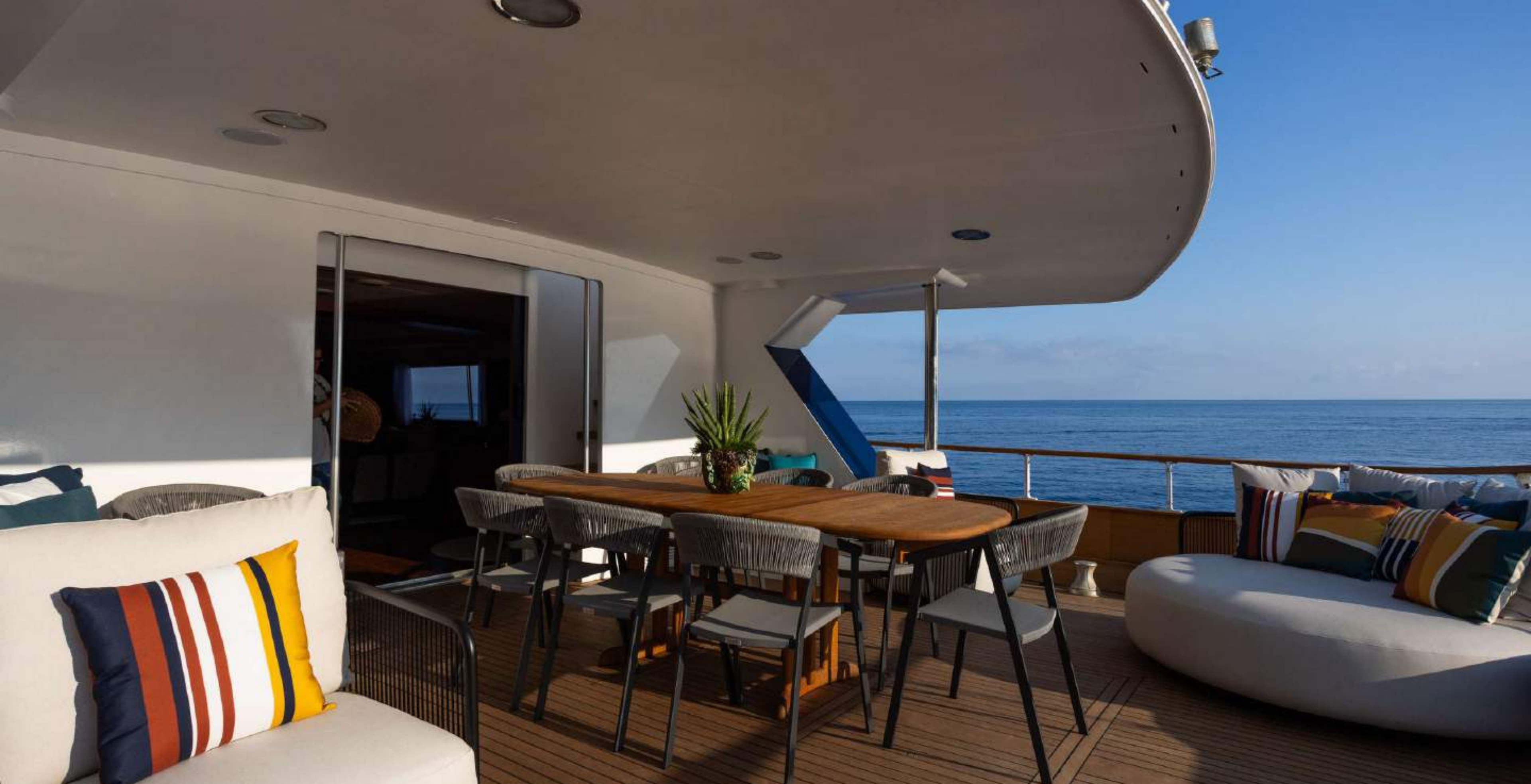
AFT MAIN DECK