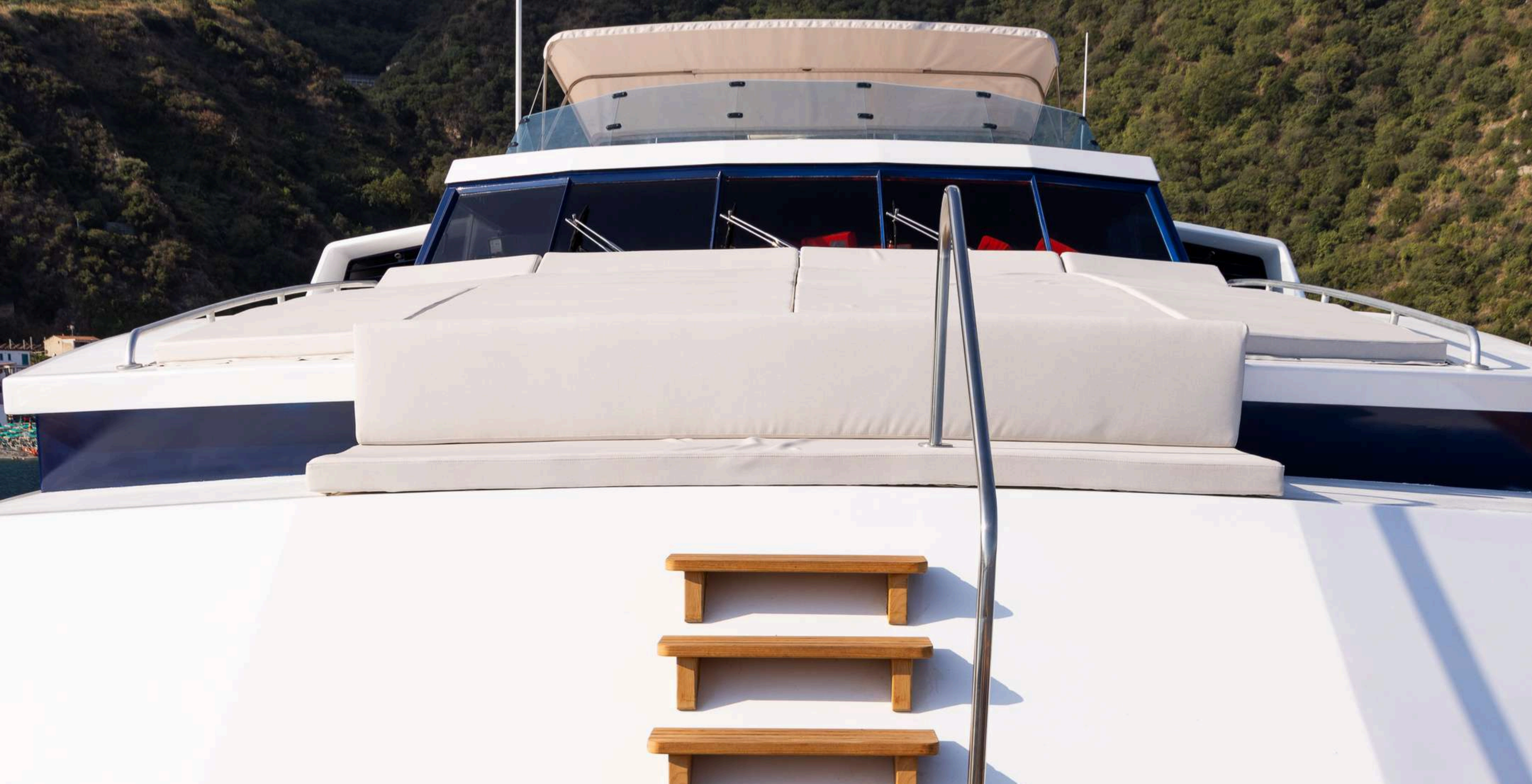
BOW | SUNBATHING AREA